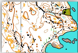
Map sample Long distance